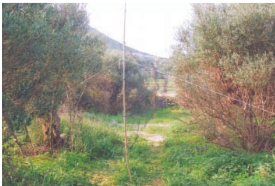
Plate I-2. A net site in an olive grove