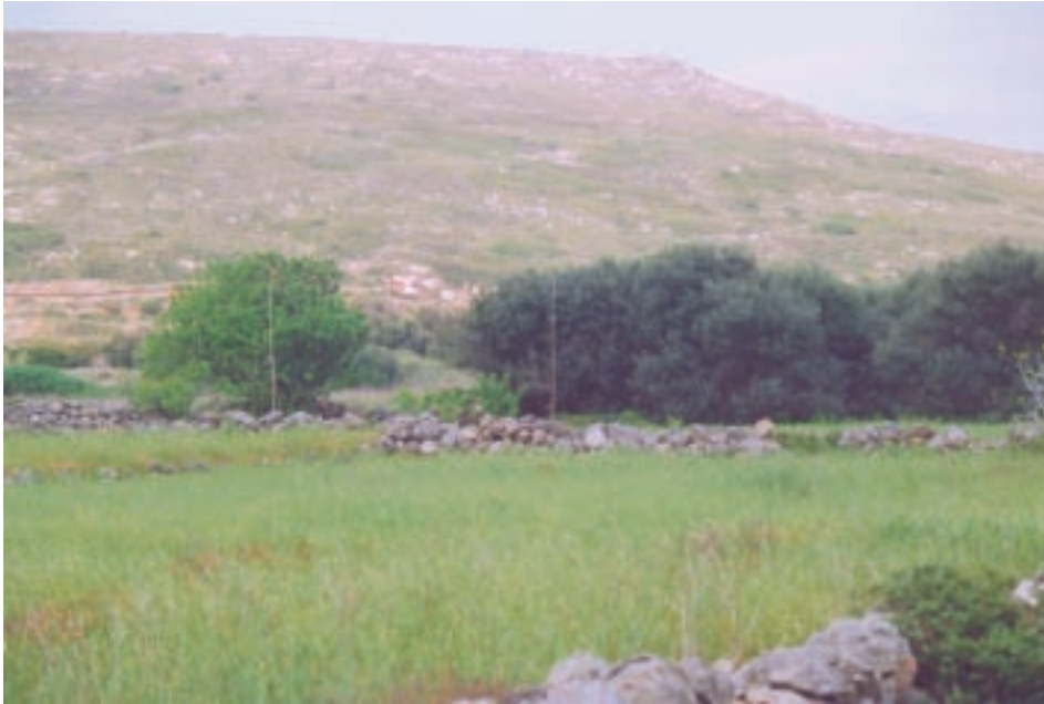
Plate II-1. A net site near cultivated land