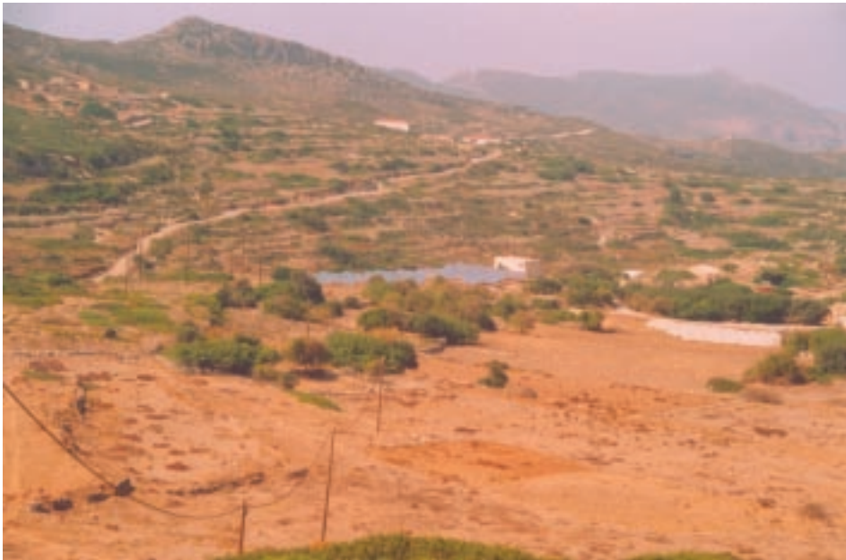
Plate II-2. A view of the island. The ringing place is the area with vegetation. The building at the top of the photo is the Ornithological Station