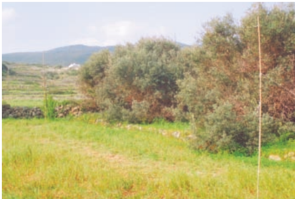
Plate I-1. A net site near an olive grove and a meadow