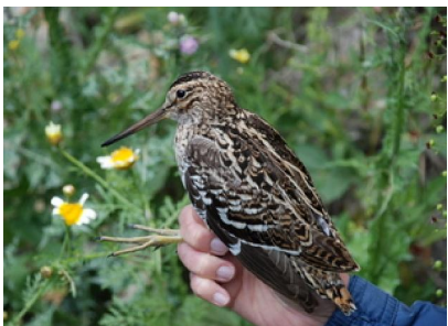
Pic 2. Great Snipe