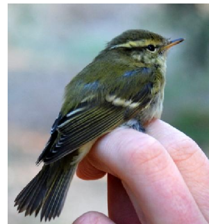
Pic 3. Yellow-browed Warbler

Seven new species were added to ABO's ringing list during the past autumn period. The new species were the Goshawk Accipiter gentilis , Hobby Falco subbuteo , Lesser Grey Shrike Lanius minor , Hedge Accentor Prunella modularis , Starling Sturnus vulgaris , Mistle Thrush Turdus viscivorus , Black Redstart Phoenicurus ochruros and the Wren Troglodytes troglodytes . Additionally it was the second year in the row that Yellow-browed Warblers Phylloscopus inornatus were caught, reinforcing our belief that the species pass through the region regularly during autumn migration.