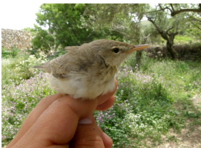
Pic 1. Olive-tree Warbler

Six new species were added to ABO's ringing list during the past spring period. Greater Short-toed Lark Calandrella brachydactyla , European Goldfinch Carduelis carduelis , Little Ringed Plover Charadrius dubius , Hawfinch Coccothraustes coccothraustes , Common Stonechat Saxicola torquatus and Brambling Fringilla montifringilla . Furthermore this season we ringed a Meadow Pipit Anthus pratensis , a Montagu's Harrier Circus pygargus , a Great Snipe Gallinago media , Olive-tree Warbler Hippolais olivetorum and a European Serin Serinus serinus , species we do not catch so often at Antikythira.