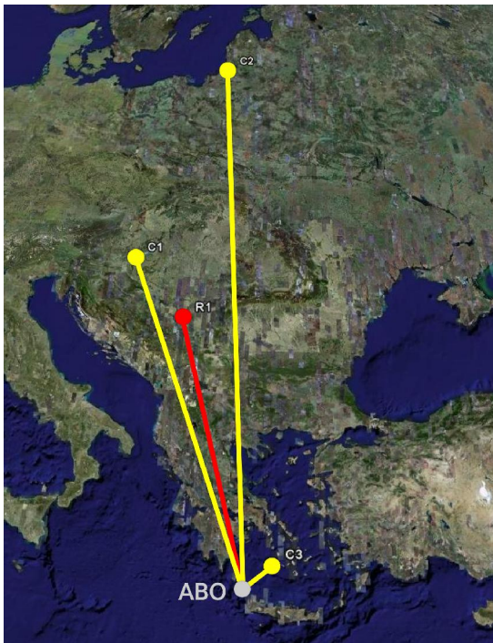
Fig. 2. Recoveries for spring season 2008.